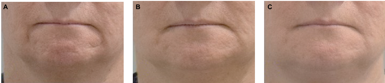
Figure 3 Scar correction with hyaluronic acid dermal filler.

Notes: A 61-year-old patient suffering from grade 2 facial lipoatrophy (Ascher's scale), before ( A and D ) and after the treatment at Week 4 ( B and E ) and Week 24 ( C and F ). A total of 8 mL of the filler was injected into the midface: 6 mL on Day 1 and 2 mL 2 weeks later for a touch-up on the left side.